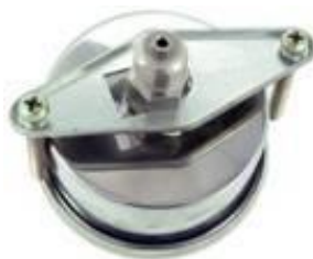
Back Mount With U-Clamp