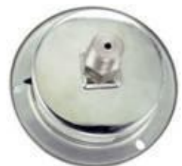
Back Mount With Front Flange