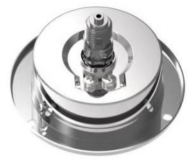
Back Mount With Front Flange