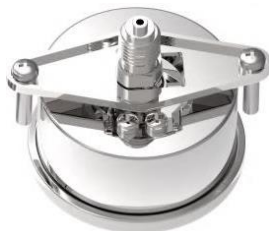
Back Mount With U-Clamp